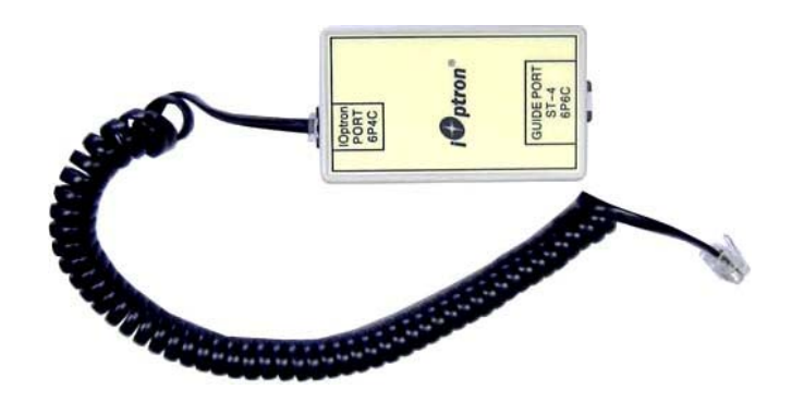
Figure 1. ST-4 adapter and cable

ST-4 Adapter has two ports, as indicated in Figure 1: iOptron Port and Guide Port. Connect one end of supplied 6P4C coiled cable to the iOptron Port of the adapter. Plug the other end into an available HBX port (Port A or Port B socket on the mount.) Connect Guide Port to ST-4 compatible autoguiding equipment using a 6P6C RJ-12 cable (not included).