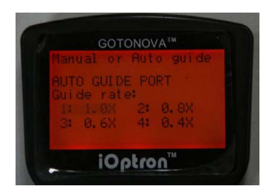
Figure 2. ST-4 adapter is connected